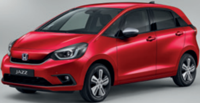
PREMIUM CRYSTAL RED METALLIC