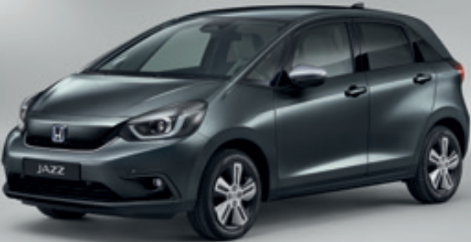
SHINING GRAY METALLIC