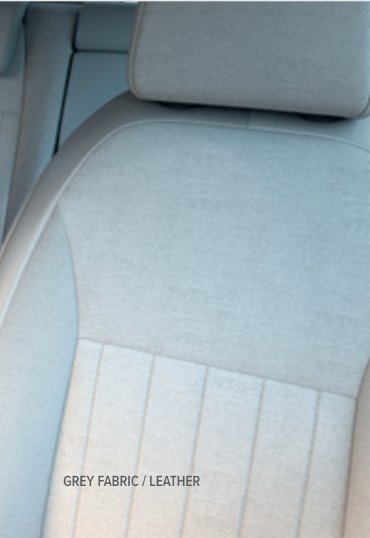
GREY FABRIC / LEATHER