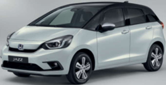
PREMIUM SUNLIGHT WHITE PEARL / TWO-TONE