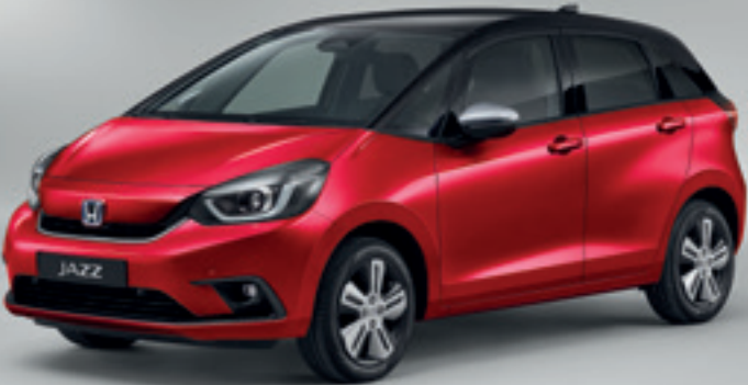
PREMIUM CRYSTAL RED METALLIC / TWO-TONE