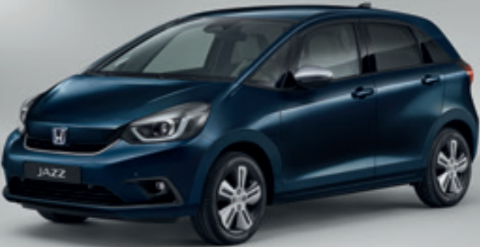
MIDNIGHT BLUE BEAM METALLIC