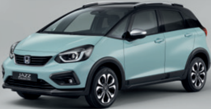
SURF BLUE / TWO-TONE