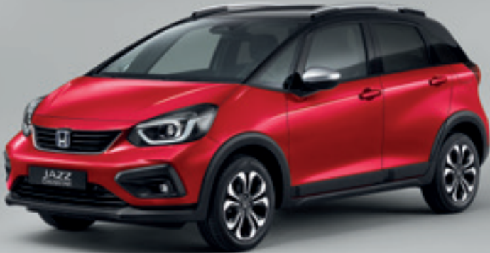
PREMIUM CRYSTAL RED METALLIC / TWO-TONE