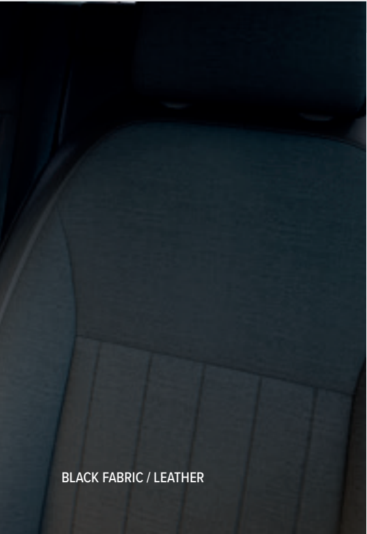
BLACK FABRIC / LEATHER