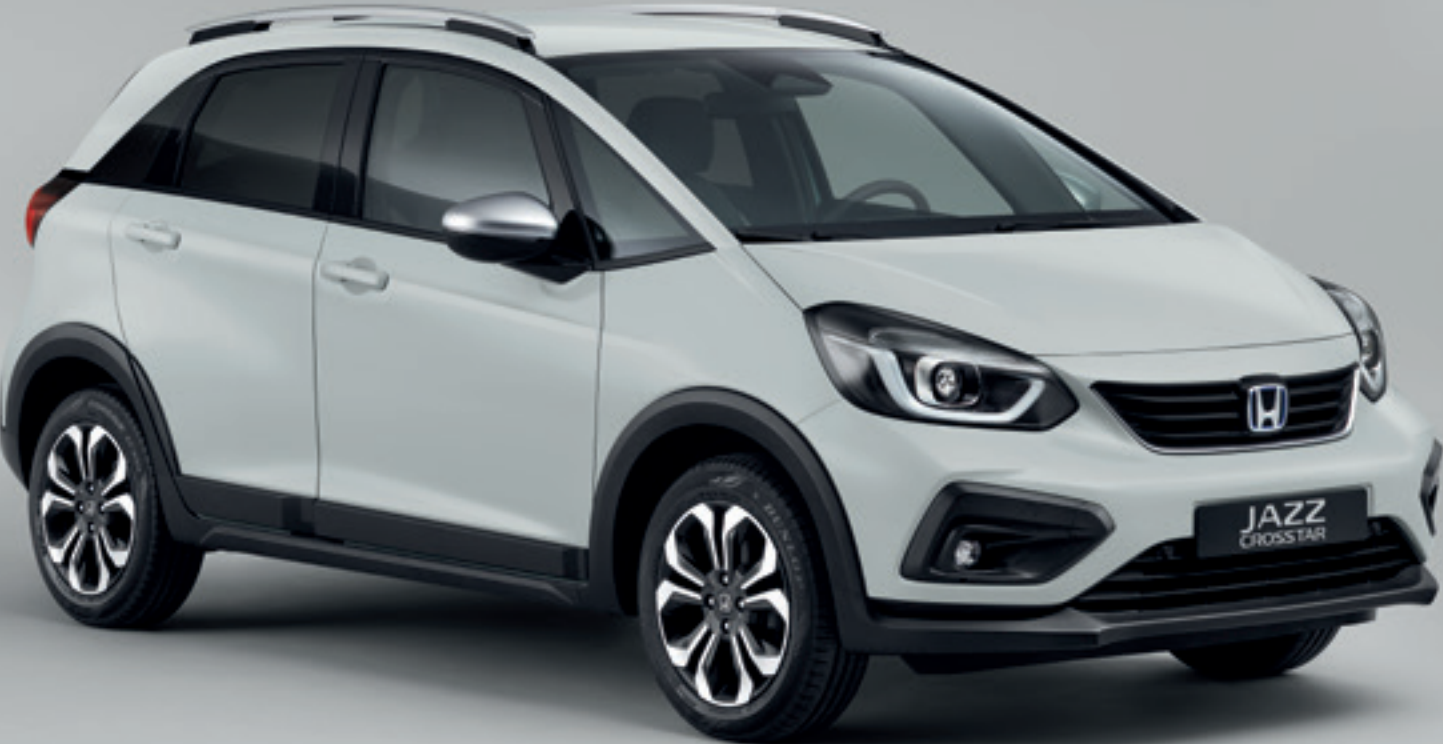
Model shown is the Jazz Crosstar 1.5 i-MMD Executive. Surf Blue and the selection of two-tone colours shown and are only available on the Jazz Crosstar.

The new Jazz Crosstar is available with an eye-catching range of two-tone and mono colourways that includes an exclusive Surf Blue. The seats are upholstered in comfortable yet tough water-resistant cloth, which helps keep the interior looking clean and smart, wherever you go.